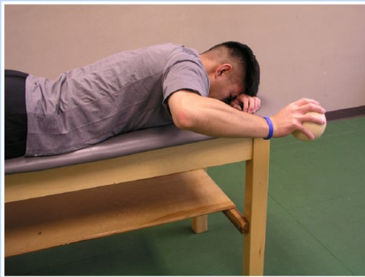
Figure 1. Prone 90/90 external rotation plyometric exercise.